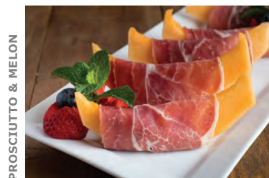
PROSCIUTTO & MELON