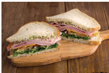
HAM & CHEESE