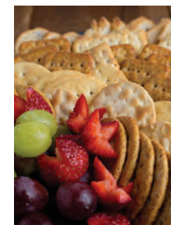
BREAD OR CRACKER TRAY