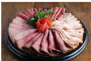
MEAT ONLY PLATTER