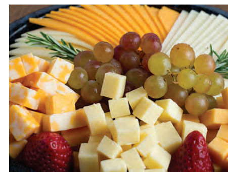
DOMESTIC CHEESE PLATTER